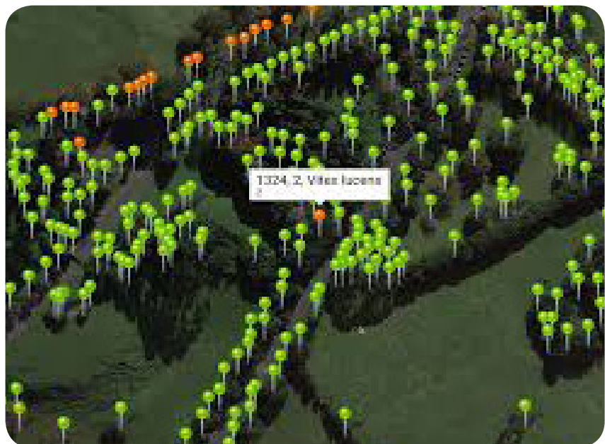
Innovative technology to solve any issues and highlight project risks quickly, efficiently and accurately.